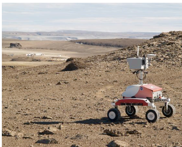
Figure 2. K10 "Red" mapping terrain at Haughton Crater with 3D scanning lidar.

Rover operations were designed to simulate a near-term lunar mission, including use of orbital data, interactive robot user interfaces, and remote operations procedures for intra-vehicular activity (IVA) and ground-control. The Haughton-Mars Project base camp served as a proxy for a lunar outpost. During three weeks of operations, the two K10's drove a total distance of 45 km (almost entirely autonomously) and returned more than 25 GB of survey data (Figure 2).