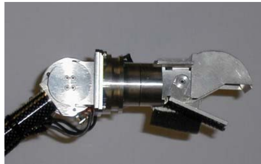
Figure 2: Developed Smart Manipulator