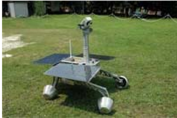
Figure 1: Developed Test-bed Rovers