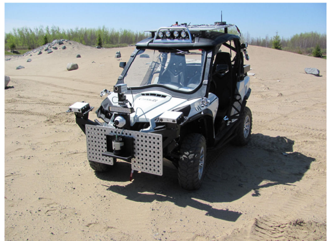
Figure 2. SL-Commander

The SL-Commanders (Fig. 2) are a second pair of vehicles developed under the ESM program as early testbeds for Hercules to support manned, tele-operated and autonomous modes of operation. The mobility platform of the SL-Commander is based on an electric version of a commercial all-terrain vehicle from BRP. As a direct result, the SL-Commander program helped catalyze a new line of commercial electric vehicles which is manufactured exclusively in Quebec, Canada. This represents a significant direct and tangible return on national space exploration technology investment, stemming from CSA’s ESM program.