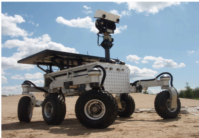
Figure 3. Mars Exploration Science Rover

Other systems developed as part of the ESM program include next generation power, communications and vision systems as well as science payloads such as a 3D microscope, ground penetrating radar and Raman spectrometer. Hercules and other ESM systems are now available to support planetary analogue scenarios, as cooperative elements alongside international lander and / or mobility systems, or as host vehicles for international exploration science and ISRU payloads. This has collectively advanced both partnerships and technology developments ahead of a number of upcoming international exploration missions from lunar precursor missions such as RESOLVE to future Mars missions like ExoMars and Mars2020.