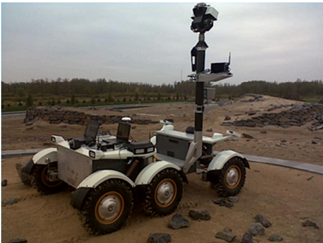
Figure 1. Hercules surveys the Analogue Terrain at CSA

Hercules is a class of lunar rover prototype developed by MDA in conjunction with a team of 14 partners for CSA under the Lunar Exploration Light Rover (LELR) project [2]. Each Hercules rover (Fig. 1) is a medium-class lunar mobility platform designed for science, prospecting, surveying and early in situ resource utilization (ISRU) mission scenarios, with full upgradability to short distance crew capability. The vehicle chassis is based on a rugged, custom-designed mobility platform built by the advanced technology centre of worldwide terrestrial vehicle leader Bombardier Recreational Products (BRP). Substantial payload accommodation is provided via several payload plates, with the largest available space accommodating up to 300 kg and 1.5 x 1.0 x 1.0 m.