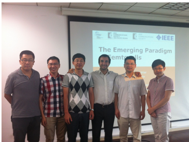
Photo taken with Beijing ComSoc Chapter Chair and some members

To summarize, it is apparent that China is a major force in wireless system design worldwide, and I hope that this DLT served to inspire a new generation of researchers and stir innovative research lines to further corroborate the leadership position of the Asia-Pacific Region.