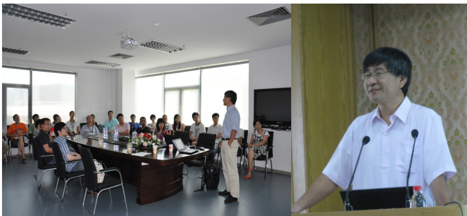
Talk at Shenzhen Institute of Advanced Technology