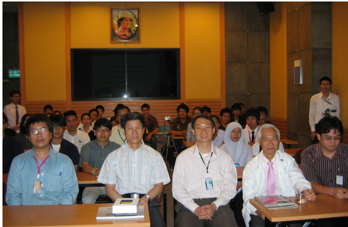
Photograph of the audiences at the distinguished lecture on May 3rd 2013