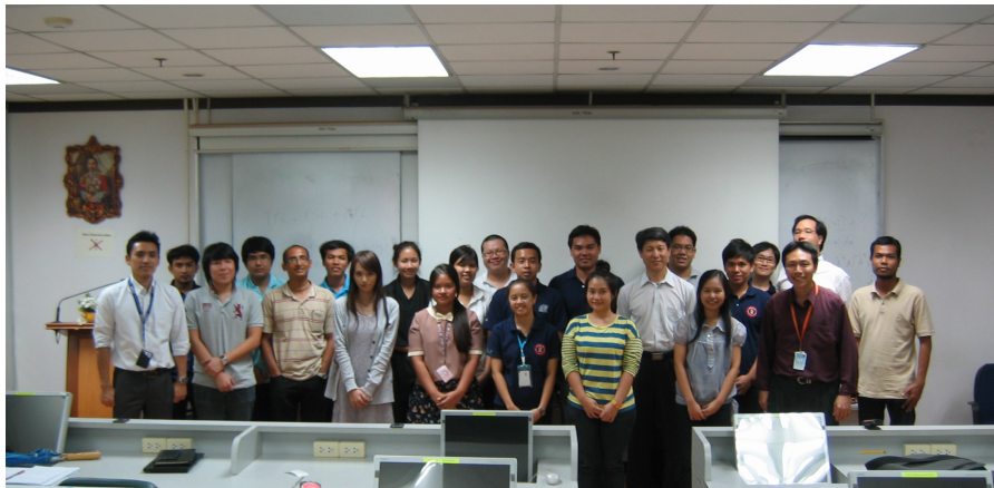
Photograph of the audiences at the EE department of the Chulalongkorn University on May 2nd 2013