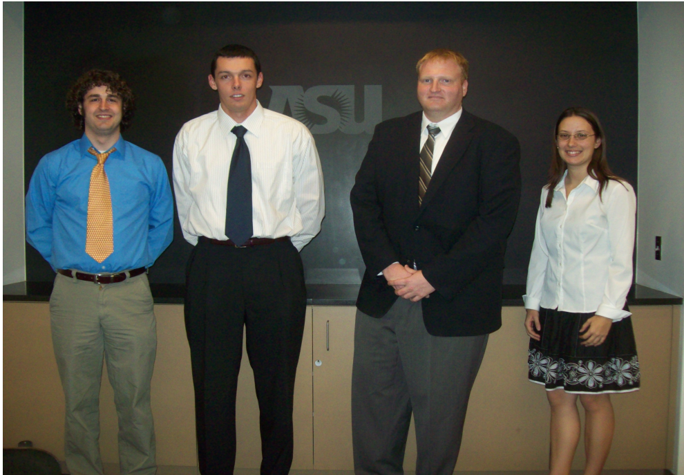
Four Generations of Presidents attended Fall 2009 Initiation