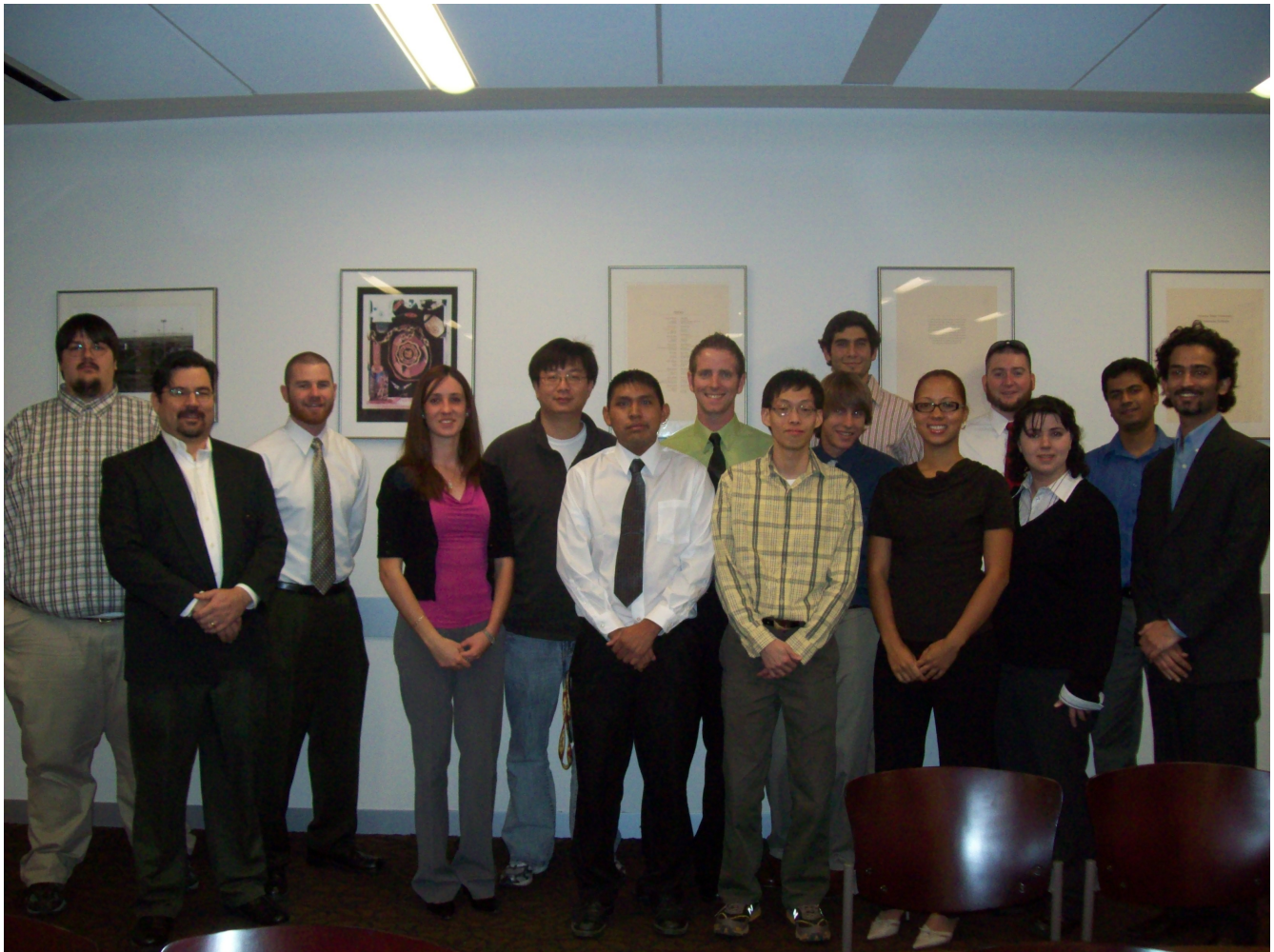
Fall 2009 Initiates