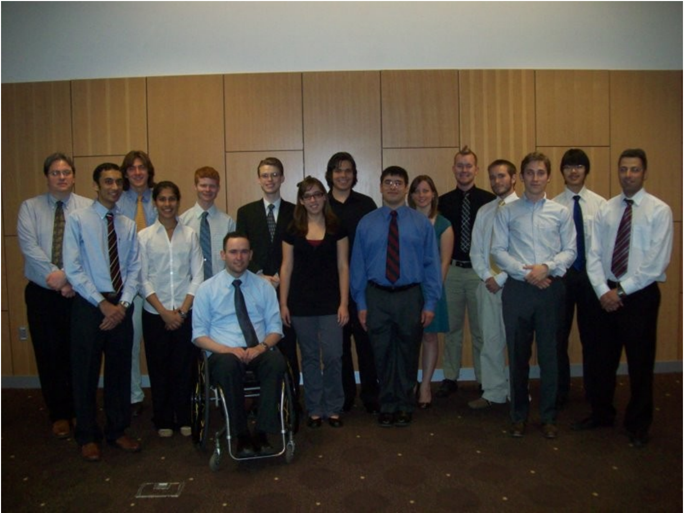
Spring 2010 Initiates