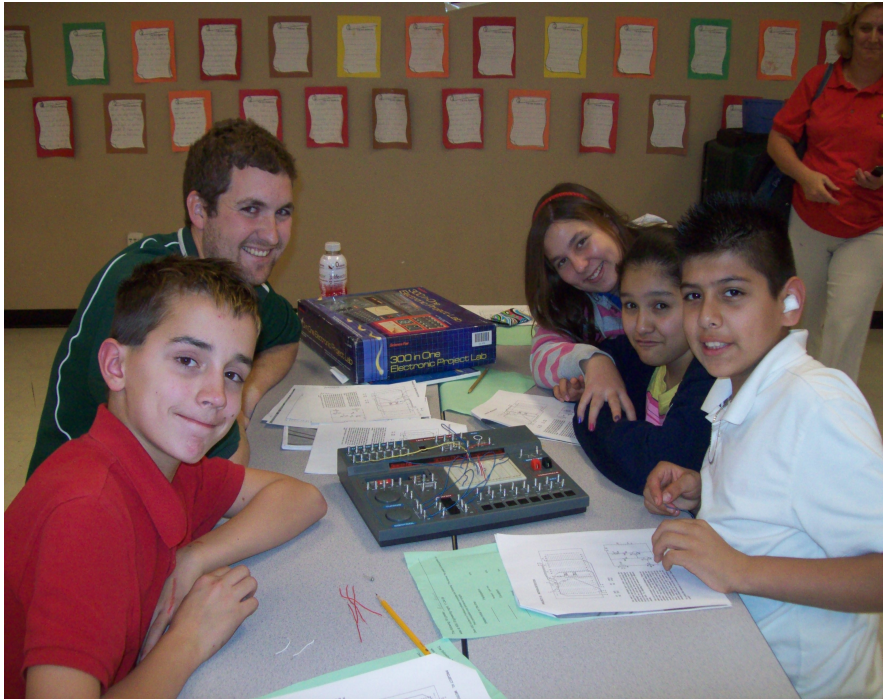
Some of the students showing off their circuit