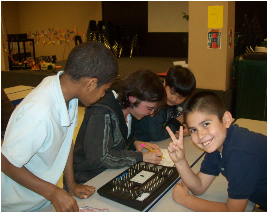
The students are excited to get to work!