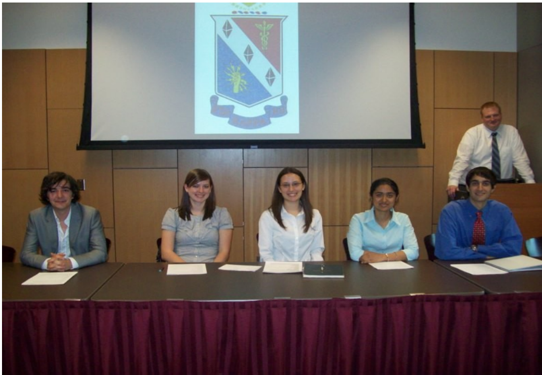
Our Spirits of the Founders of Electrical Engineering already to read!