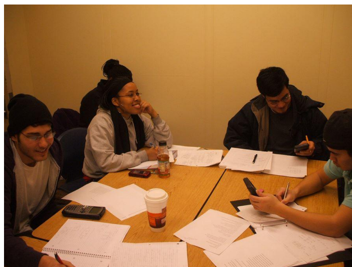
Figure 4: ECE Students Getting Help from the Tutor

The tutor room is a very fun and rewarding experience. Below are some photos of students in the tutor room.