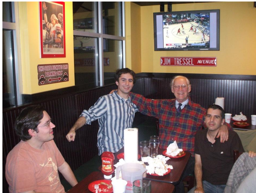
Figure 9: Student-Faculty Interaction

get and understanding for their interests and hobbies. It also allows for networking and developing relationships for the basis of recommendation letters and future graduate school plans. Most of all is a fun, relaxing time, and is meant to reward members for all their hard work with the tutor room. The member socials are not a service activity but involve 30+ members for 2-3 hours per event, for a total of 360 person-hours per year. Below are some photos from this past year's social events.