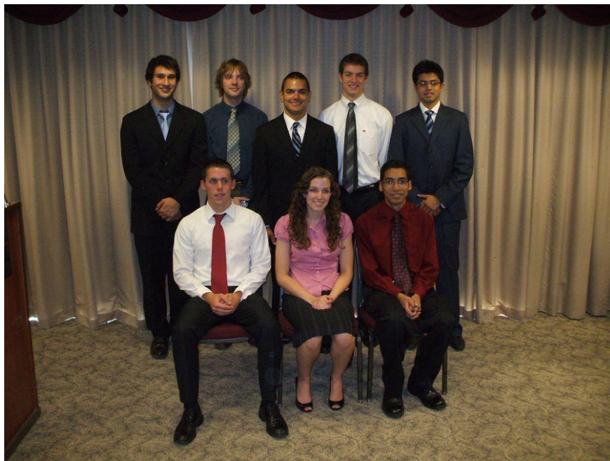
Figure 3: Spring 2010 Induction Class