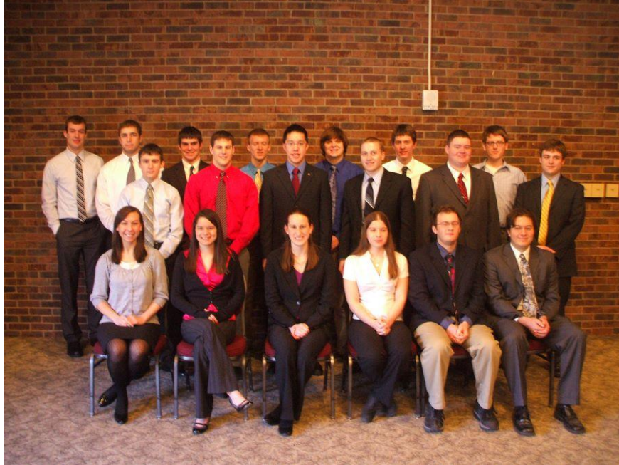
Figure 2: Winter 2010 Induction Class