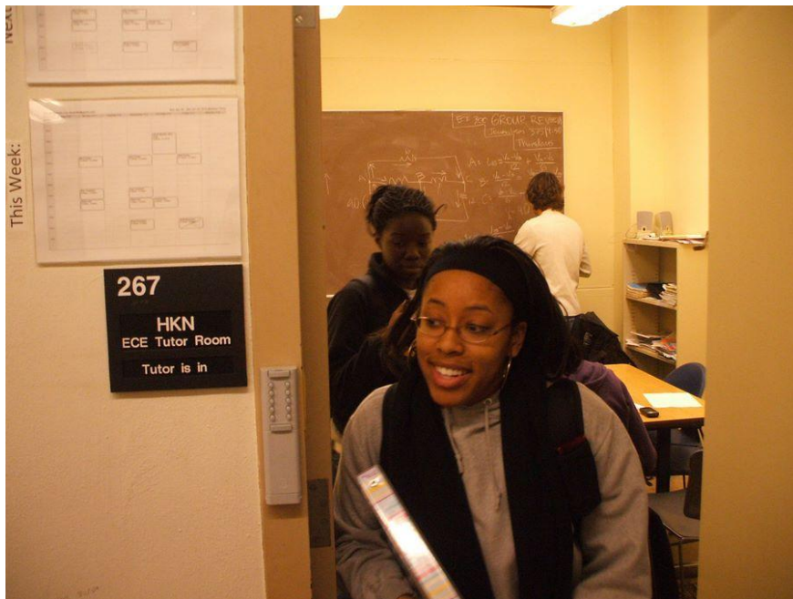
Figure 6: Students Leaving the Tutor Room