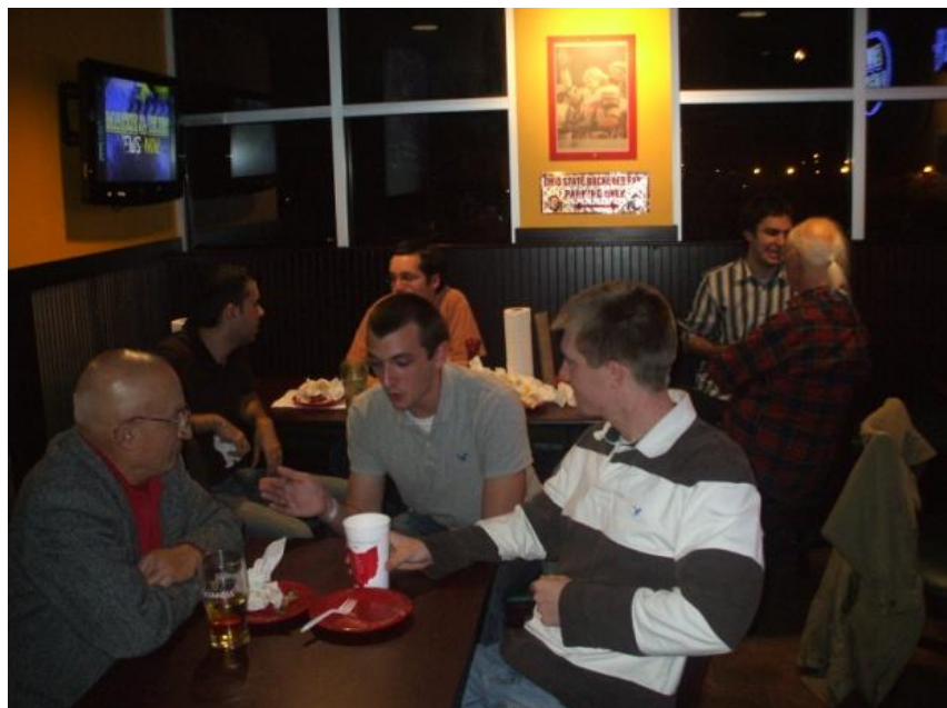
Figure 10: Member Social at Buffalo Wings and Rings