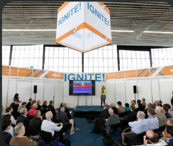
IEEE SECTIONS CONGRESS 2014 AMSTERDAM, NETHERLANDS