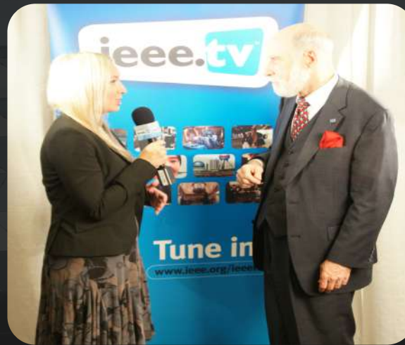
IEEE SECTIONS CONGRESS 2011 SAN FRANCISCO, CALIFORNIA, USA