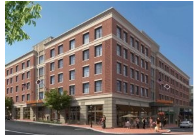
Portsmouth Harbor Events & Conference Center

Relative to this theme, the NH Section is partnering with the Boston and Maine Sections to sponsor an Industry Day event. This is a one day meeting designed to foster collaboration between industry and the IEEE. It is tentatively scheduled for September 23rd and I'm pleased to announce that it will be held in the new Portsmouth Harbor Events & Conference Center . This facility is centrally located and attractive for both business and possible social activities. The NH venue provides our members a unique opportunity to develop beneficial relationships at both a professional and corporate level. Details will be available as the planning solidifies.