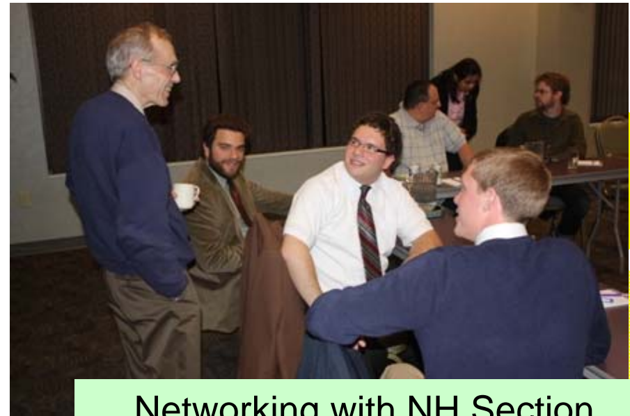
Networking with NH Section Chair and Officers before the event begun