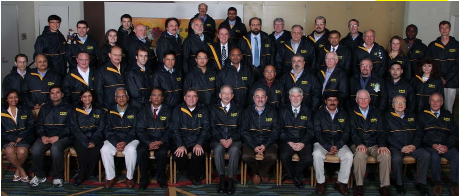
IEEE Region 1 Board of Governor Sections Congress 2011 – San Francisco August 19, 2011