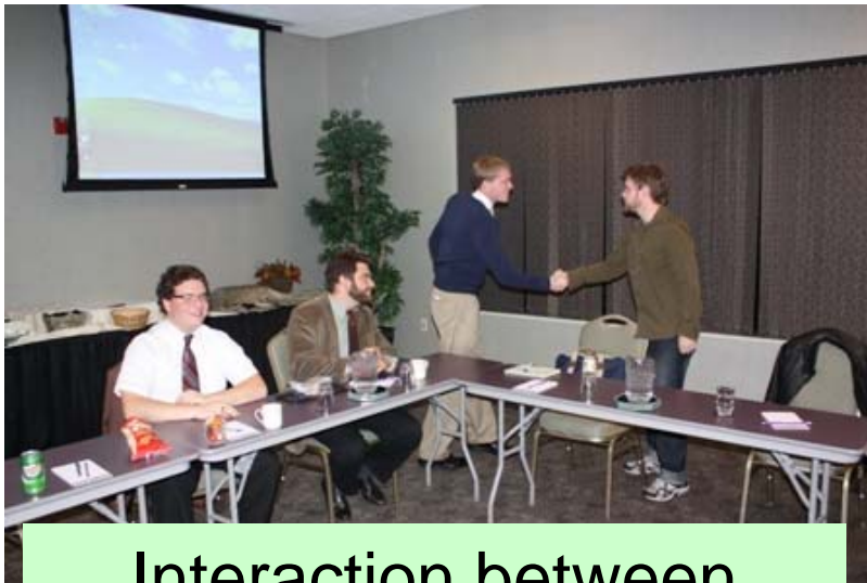
Interaction between student members