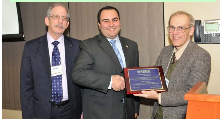
Presentation of Awards