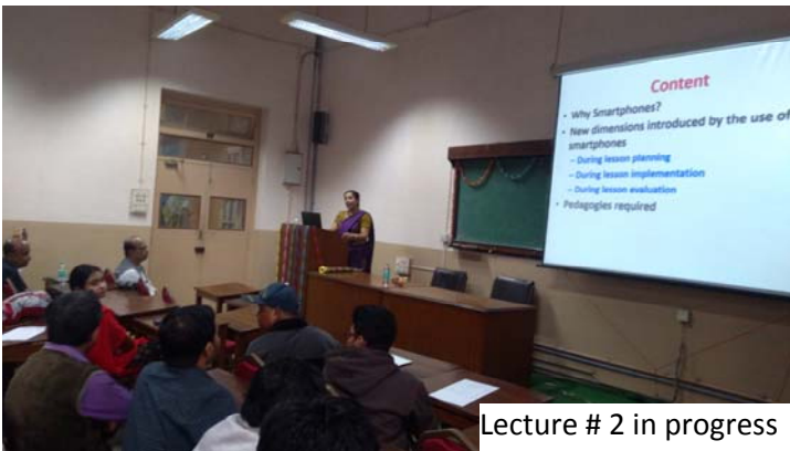
Lecture # 2 in progress