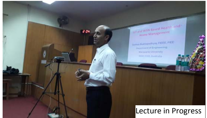
Lecture in Progress