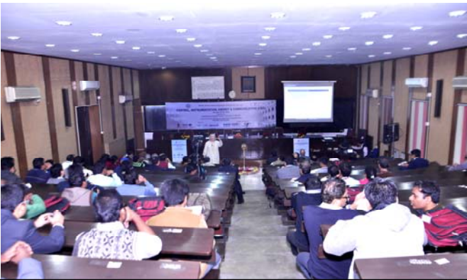
Keynote lecture by Prof Sarah Spurgeon under progress

There were adequate interactions amongst the participants and experts. The conference proceeding was published with an ISBN No. of 978-1-5090-0035-7. All the presented research papers are now available in IEEEExplore digital library.