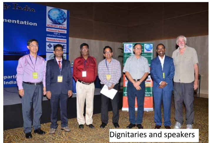
Dignitaries and speakers