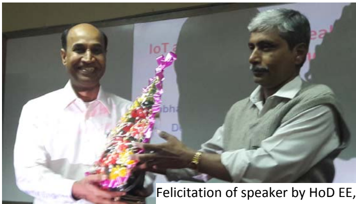
Felicitation of speaker by HoD EE,