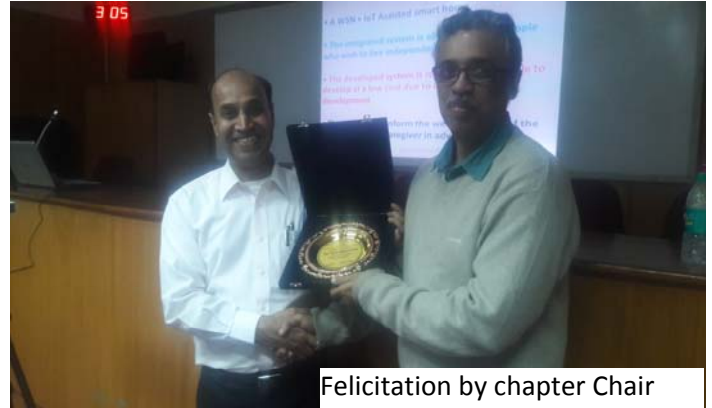
Felicitation by chapter Chair