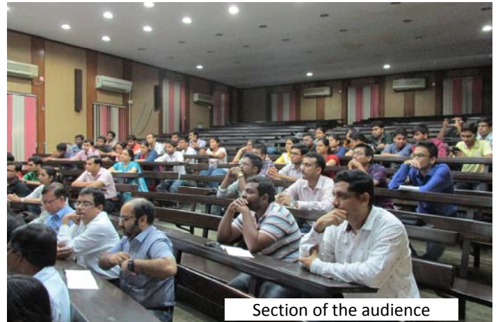
Section of the audience