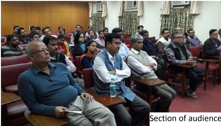
Section of audience