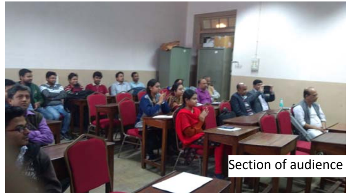
Section of audience