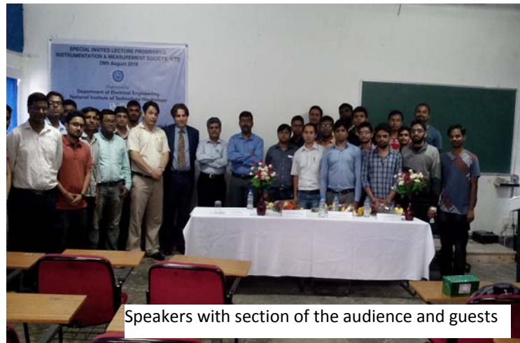
Speakers with section of the audience and guests