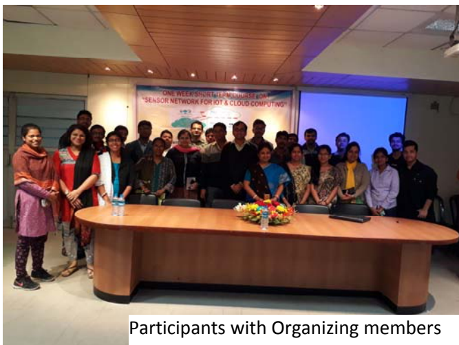
Participants with Organizing members