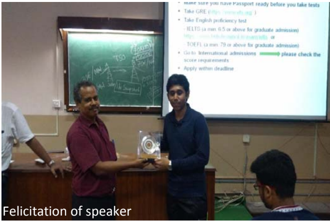
Felicitation of speaker