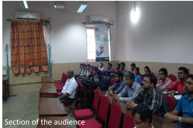
Section of the audience