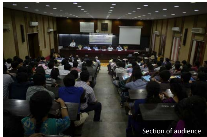
Section of audience