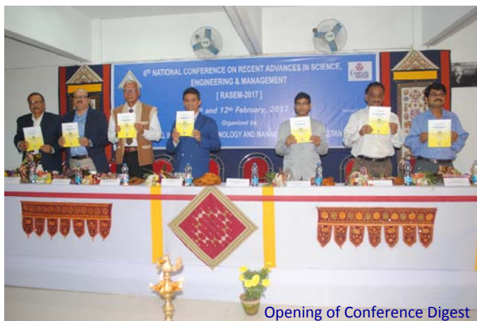
Opening of Conference Digest