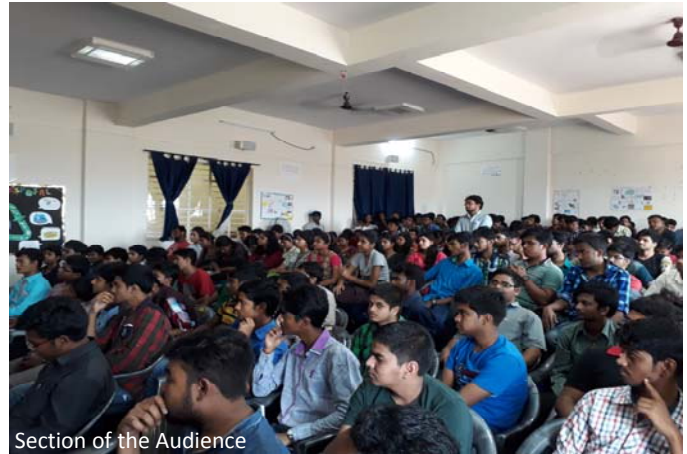
Section of the Audience