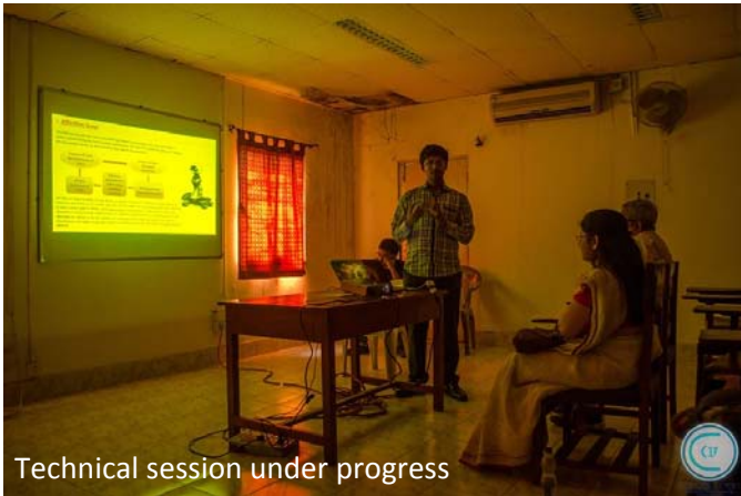
Technical session under progress