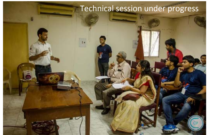
Technical session under progress