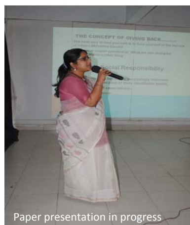
Paper presentation in progress