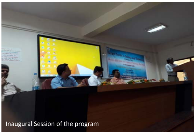
Inaugural Session of the program