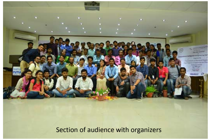
Section of audience with organizers