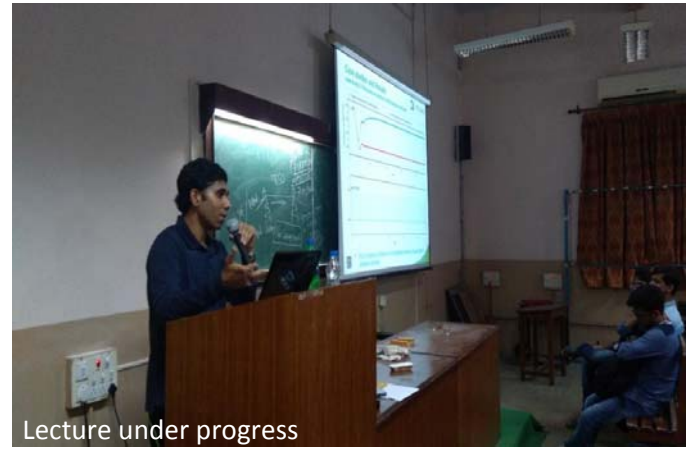
Lecture under progress