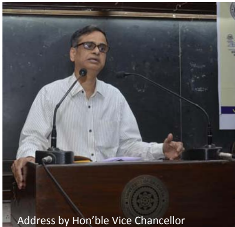
Address by Hon'ble Vice Chancellor