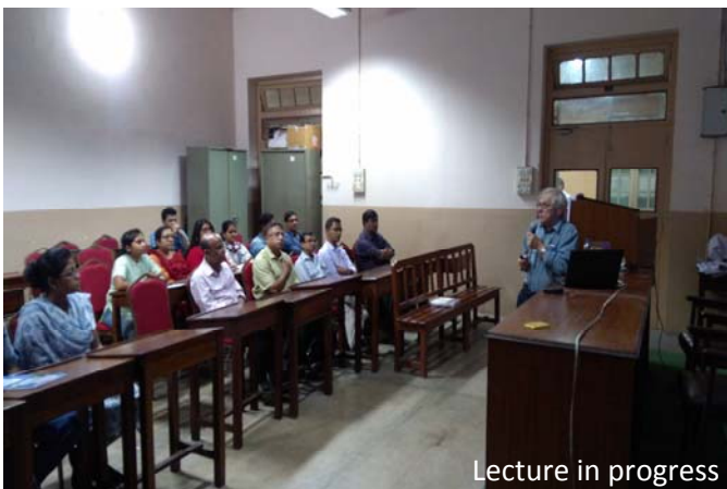
Lecture in progress