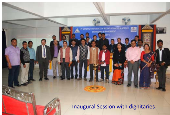
Inaugural Session with dignitaries