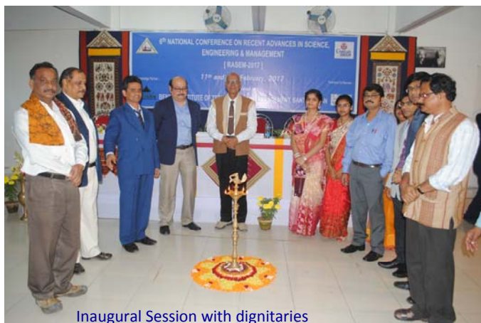
Inaugural Session with dignitaries

Chapter. The conference was three major tracks: Track 1: Recent advances in Science; Track 2: Various fields of Engineering; Track 3: Management Science, Hospitality & Tourism Management. Out of 145 number of research papers only 59 number of papers has been selected for the conference presentation, out of that two (02) papers from University of KwaZulu-Natal, South Africa, one (01) paper from University of Wisconsin at Milwaukee, USA, one (01) paper from IIT- Ropar, five (03) from Visva- Bharati University, two (02) from Aliah University, two (02) from RCCIIT and the rest are from Jadavpur University, HIT, NITTTR, CSIR Indian Institute of Chemical Biology, NIT- Agartala, NIT-Durgapur, IMS- Kolkata, CIT- Madhyamgram and BITM- Santiniketan.