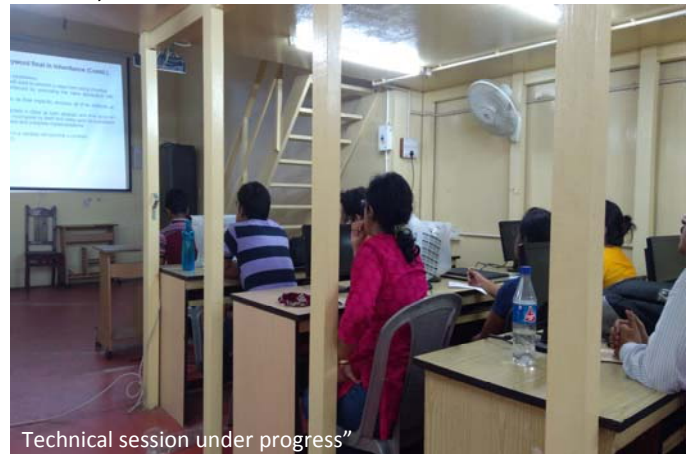
Technical session under progress”