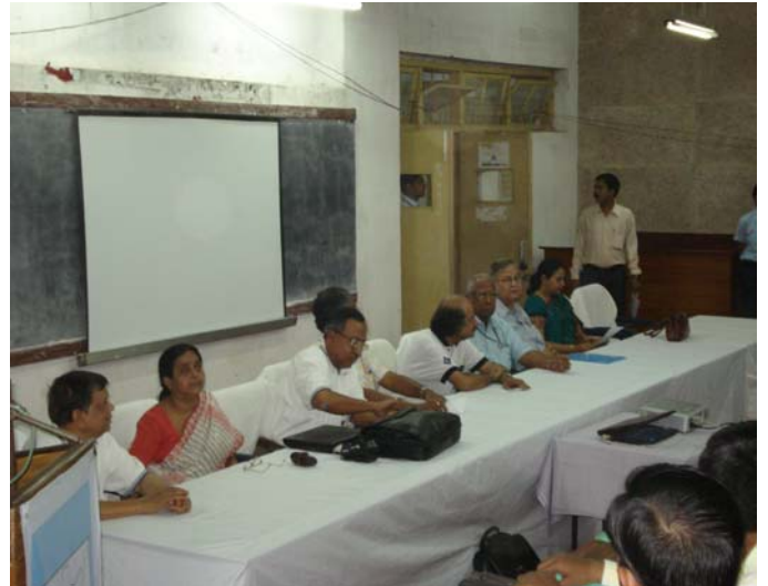
Invited Dignitaries with Professors of BIET At The Inaugural Session