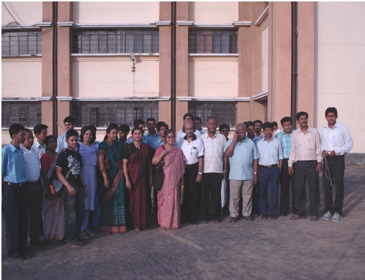
The Picture Perfect-the IEEE delegates with the faculty and the students of BIET