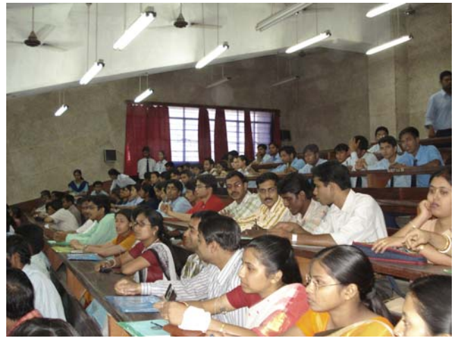
Faculty and Students participating in the program, full house.