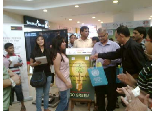
Prize distribution on the second day

We have certificates for all the participants whose ideas we have found interesting and worthy of credit. Certificates will be given to volunteers also. Certificates will also be given to key staff members from sponsor companies-because it shows their devotion for cause of Environment.