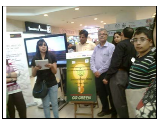
Participants at Environment Awareness Event at Select City Walk, Saket, New Delhi

We have come to the final stage of our Environment Awareness Event which was held on 9th and 10th June at Select City Walk, Saket, and that is to award participants, both idea winners, sponsor active staff and volunteers.