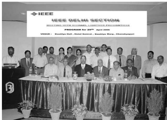
Delhi Section & India Council Exec Com Members with IEEE President