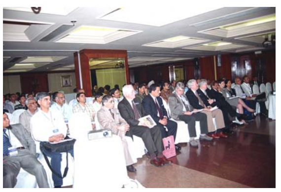
A general view of the part of the audience including PES Exec Com in the first row during Conference inauguration