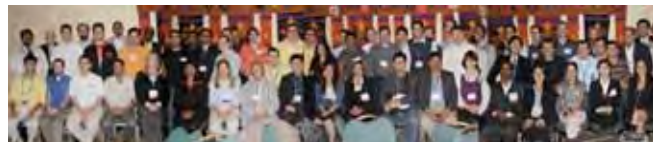
Gold delegates at Gold Summit 2008, Quebec City

The first implementations of this program will be experimented around the world in 2009. The IEEE community hopes to see improved retention of young members and increased involvement of Gold volunteers as a result.