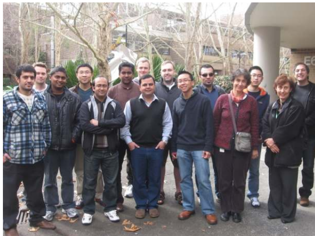
2010 MQEC Committee Executives and Volunteers