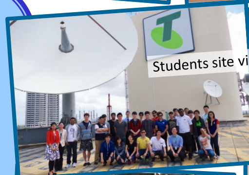
Students site visit to Telstra 2015