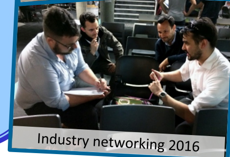
Industry networking 2016