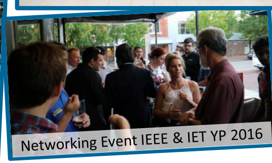
Networking Event IEEE & IET YP 2016