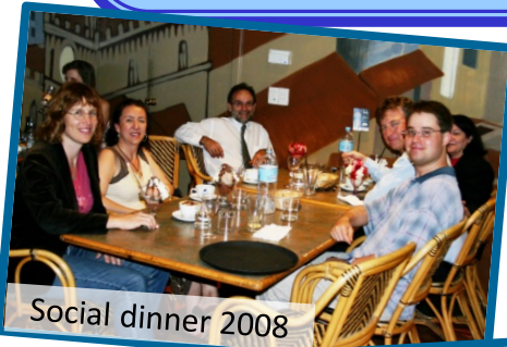
Social dinner 2008