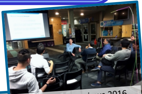
Mock job interviews 2016