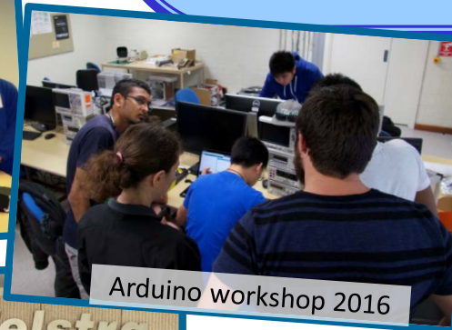
Arduino workshop 2016