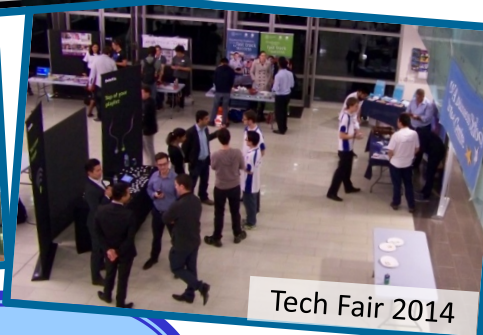
Tech Fair 2014