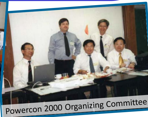
Powercon 2000 Organizing Committee