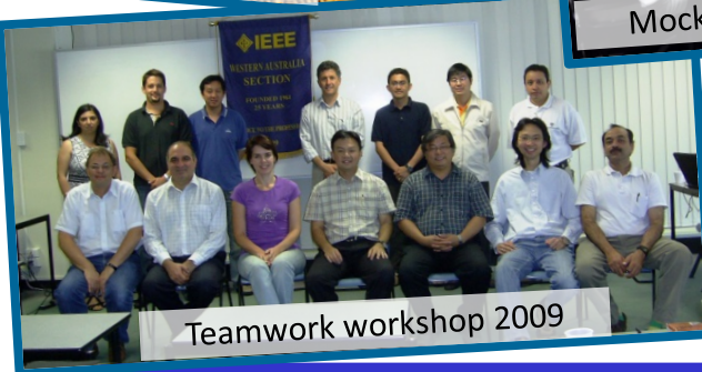
Teamwork workshop 2009