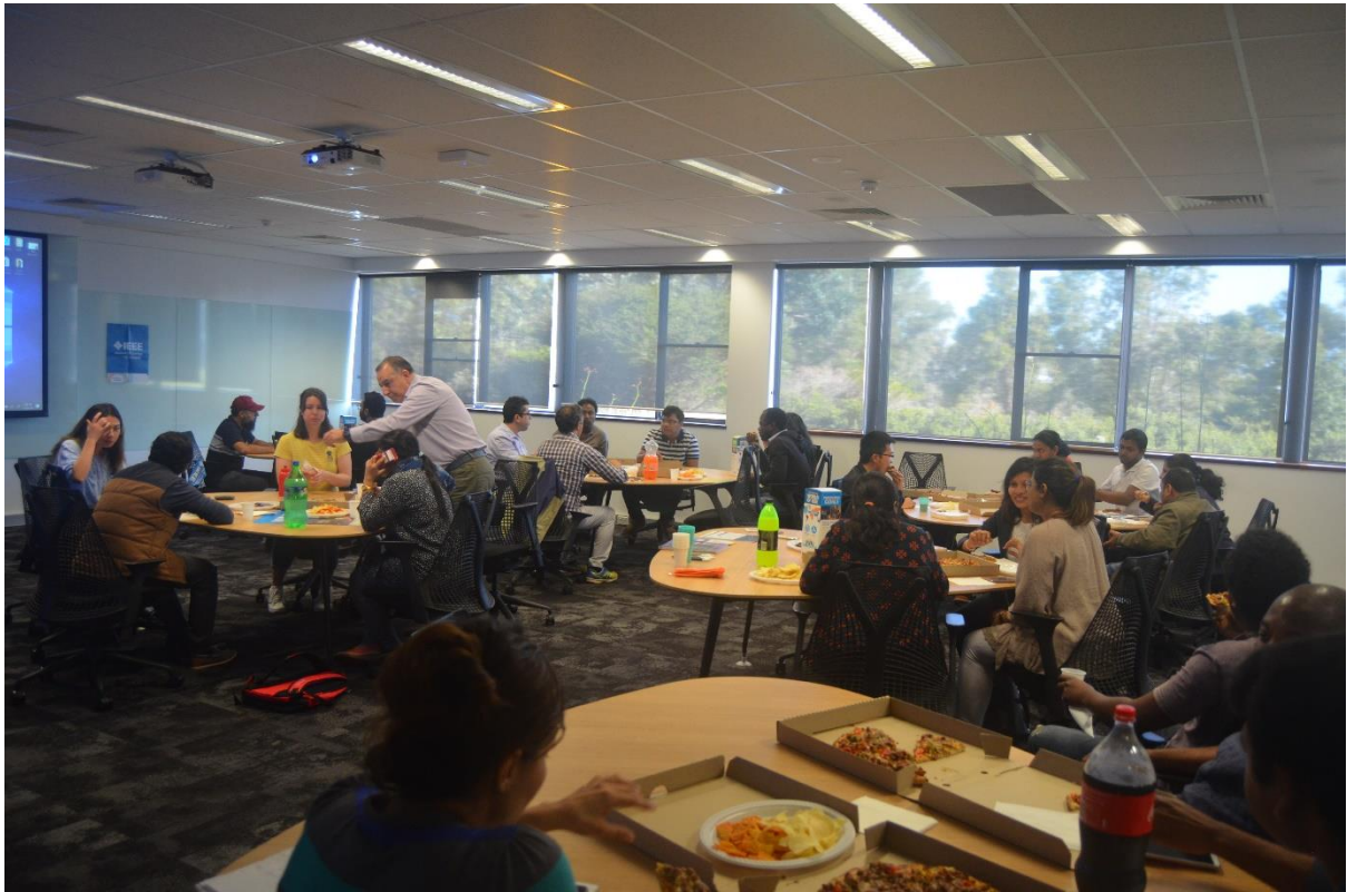
After event socializing and networking among the students over the pizza party and drinks-2