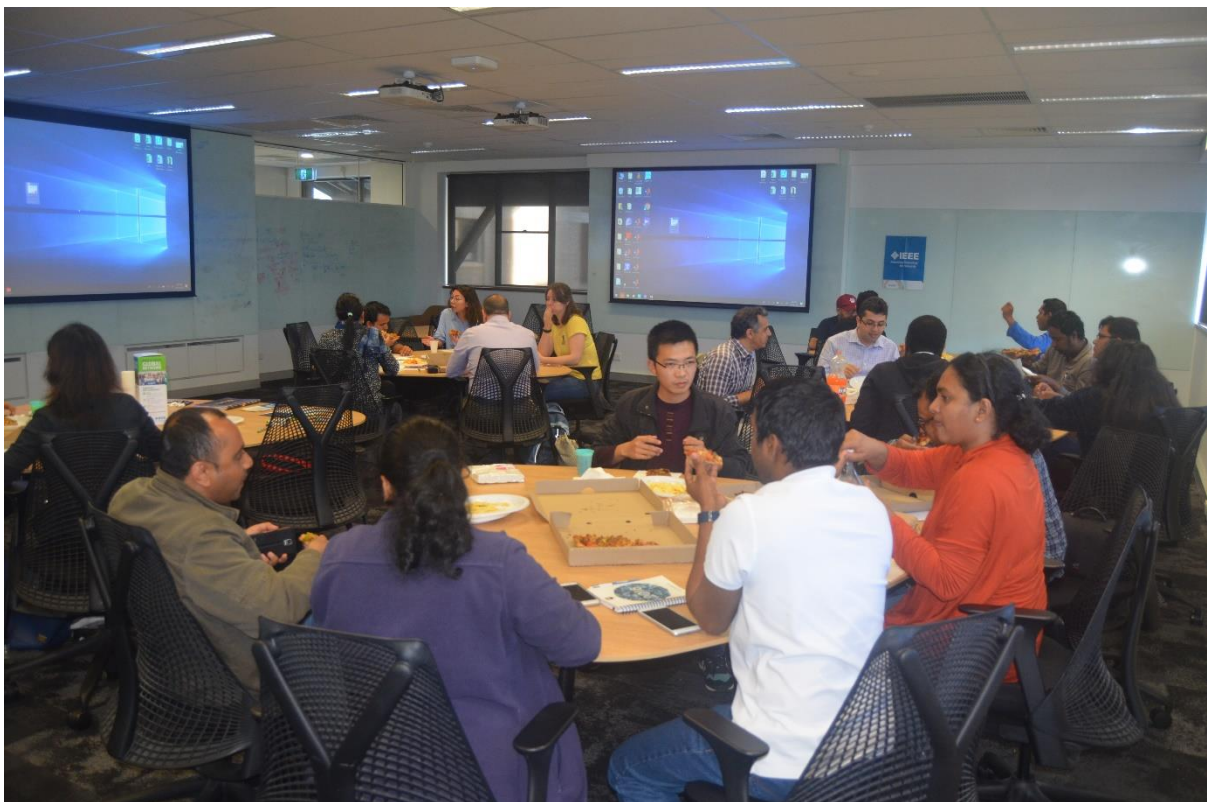
After event socializing and networking among the students over the pizza party and drinks-1