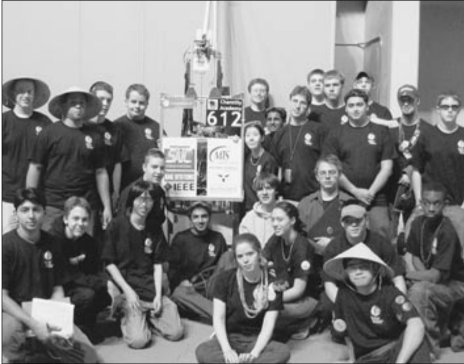
The Chantilly Academy team took their robot to the FIRST competition.

During the first week in March, 1,500 high school students from more than 60 schools converged on the Siegel Center at Virginia Commonwealth University (VCU) in Richmond, Virginia for the NASA/VCU FIRST Robotics regional competition. The Chantilly Academy team and the Oakton High School team, both sponsored by the IEEE Northern Virginia Section, took part in the competition.