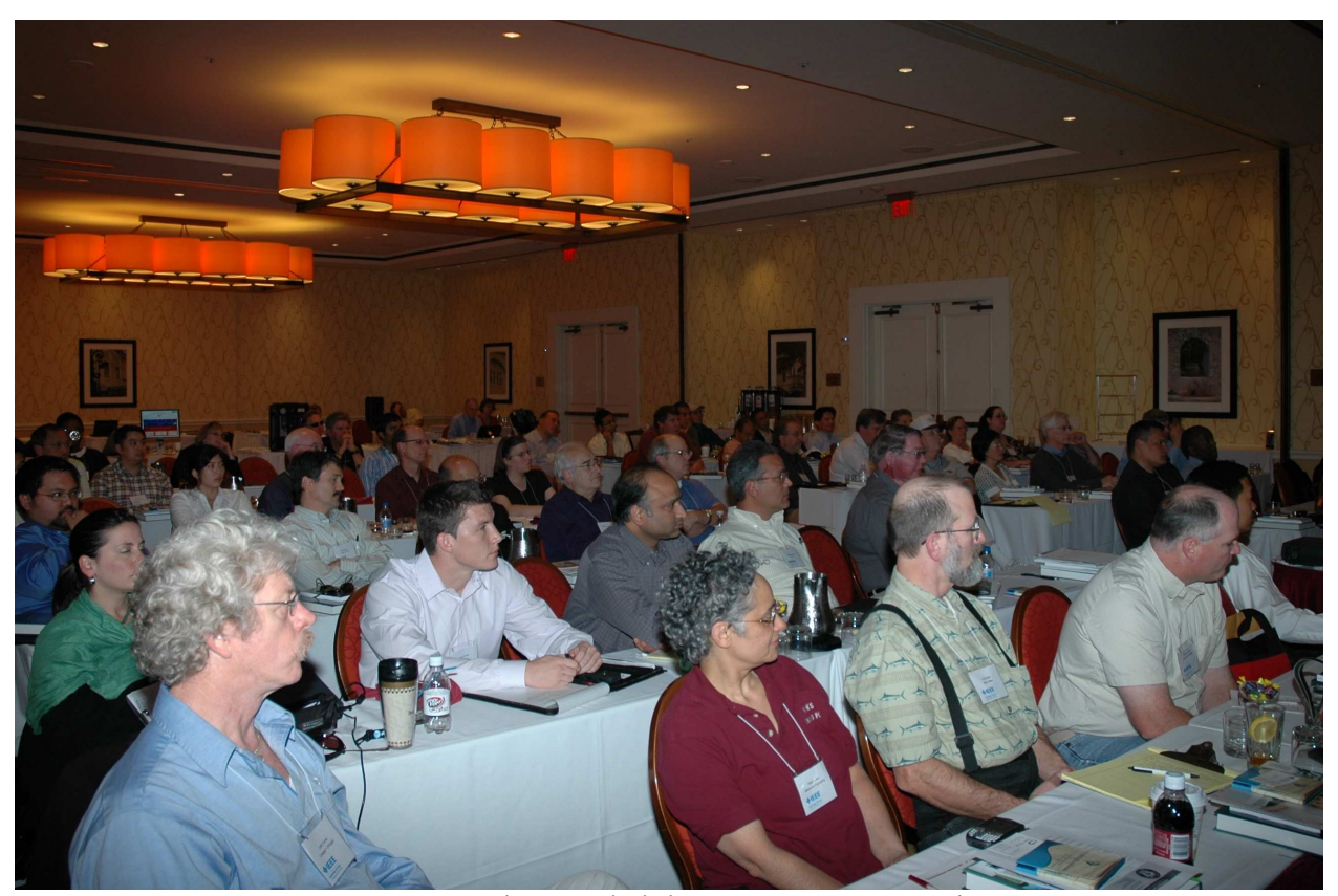
Over 65 people attended the IEEE SF IAS Seminar!