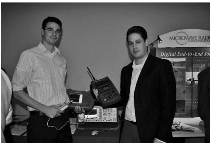
Our sponsors in the exhibition room