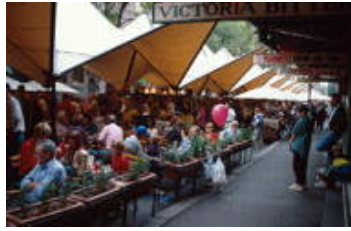
The Rocks Markets, The Rocks, Sydney

Full details of the Accompanying Persons Registration and these tours will be available on the website by the end of September 2002.