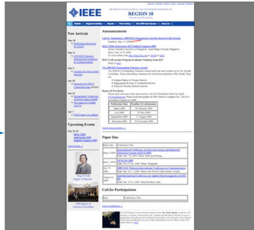
new top page