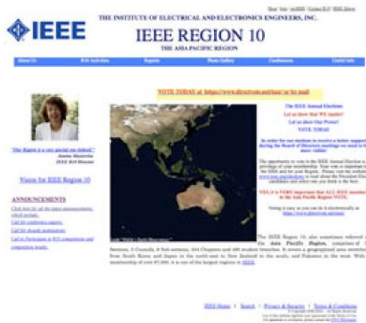
old top page