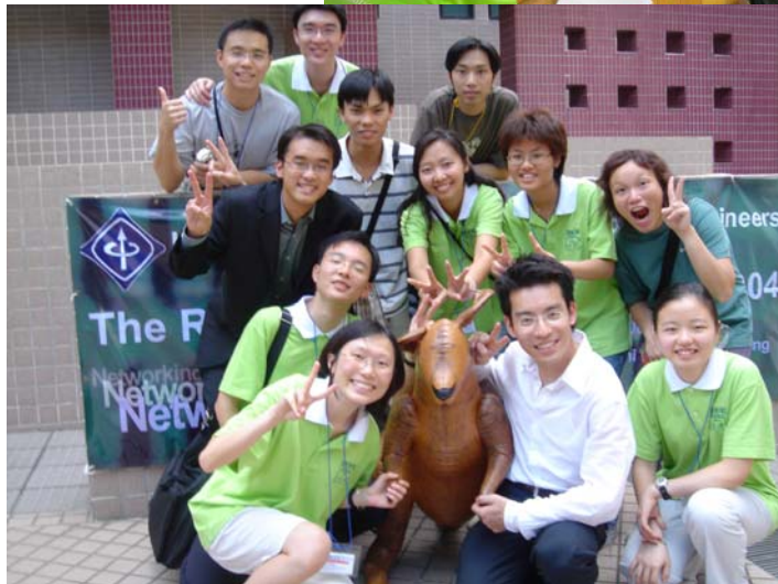
R10SC HK Organizing Committee