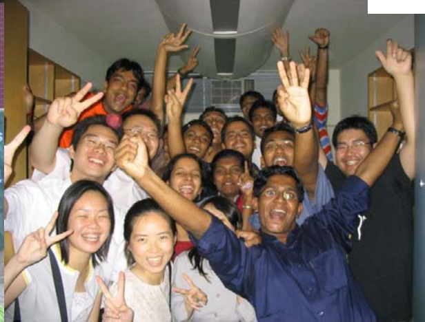
We met Signal-8 typhoon!