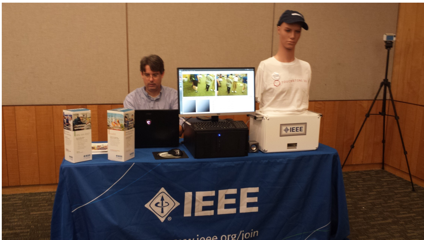
Humanoid Robot Project, (East North Carolina Section)