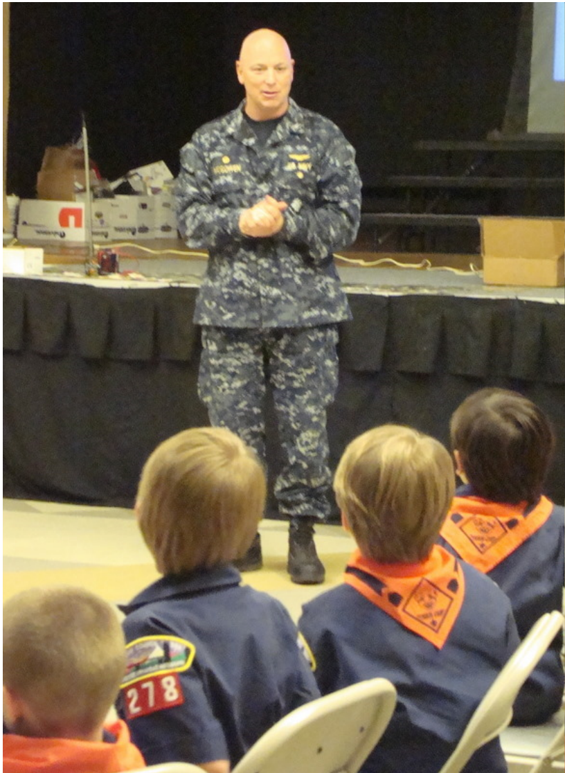
Mentoring Boy Scouts about Engineering