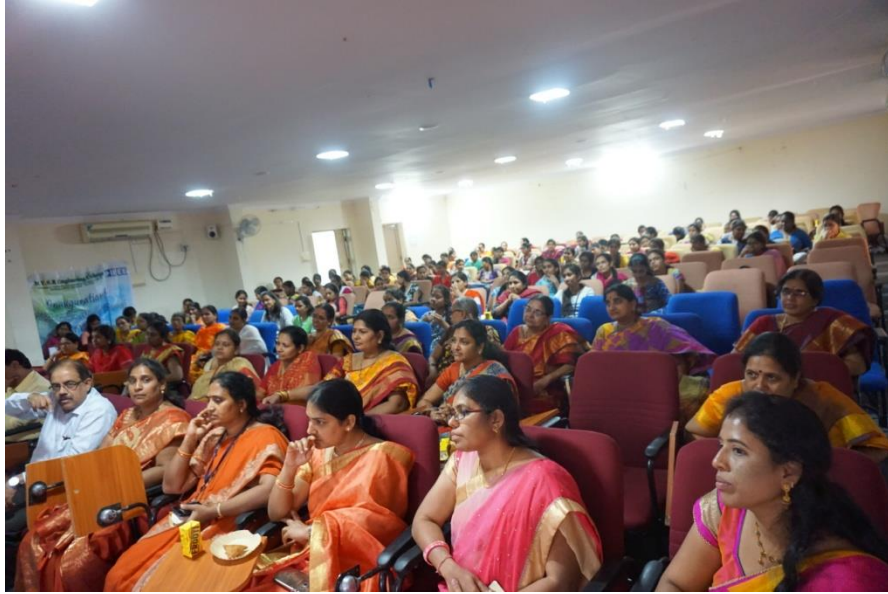
The audience for the afternoon session.