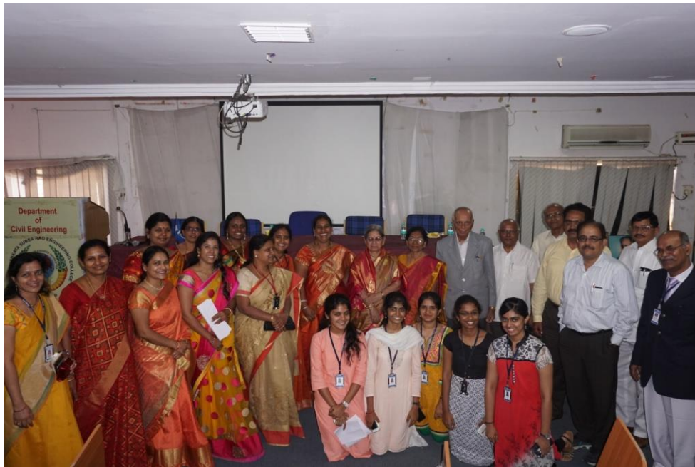
Picture of event organizers along with the chief guest, guest of honour, Principal, Vice Principal and faculty of MVSr.