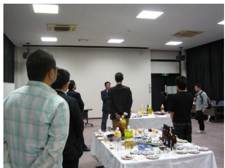
2010 IEEE Student Branch Leadership Training Workshop