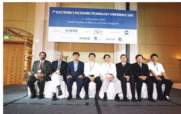
Members of IAB and IEEE CPMT at EPTC 2005

Join us at the 8 th EPTC, 6-8 December, 2006, at the Pan Pacific Hotel, Singapore. See the Call for Papers later in this Newsletter .