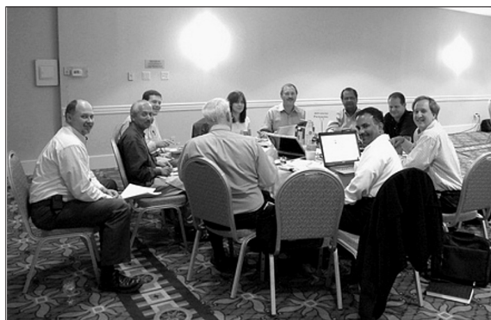
Advanced Packaging subcommittee which traditionally attracts the highest number of abstracts, is working on identifying their sessions.