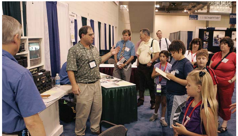
Part of the Children's Workshop each year is some time spent touring the exhibition to see new products. This year, there was a unique stop at the ham radio area. This presented a great opportunity for the children to learn about ham radios. They are the perfect age to get hooked!