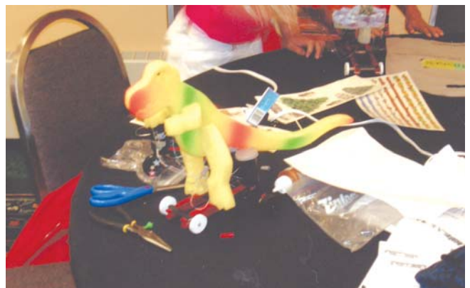
Second Place winner of the 2005 IEEE Car Race.