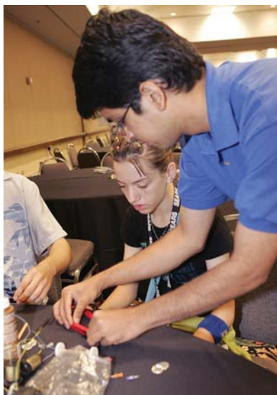
Building something that works from regular household "stuff" can be very interesting!