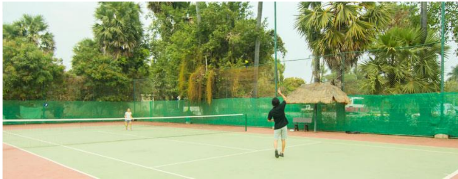
❖ Tennis Courts