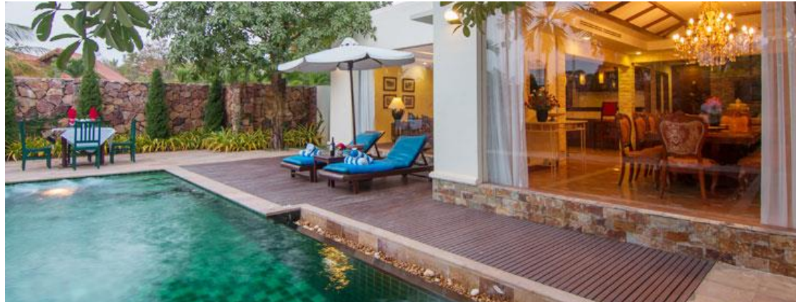
❖ 1, 2 & 3 Bedroom Pool Villas