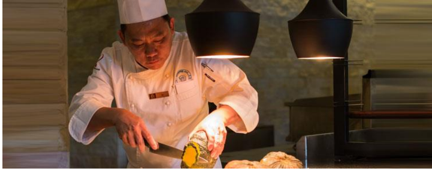
❖ Khmer Cooking Classes