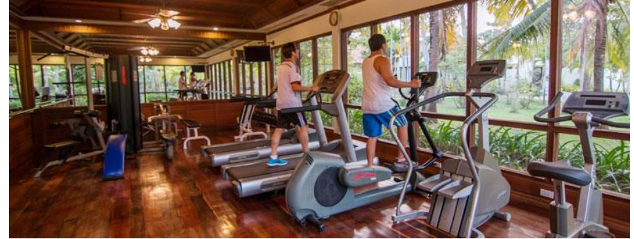
❖ Fully equipped Gym