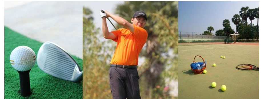
❖ Driving Range