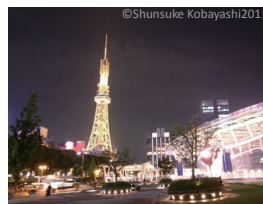
Nagoya TV Tower