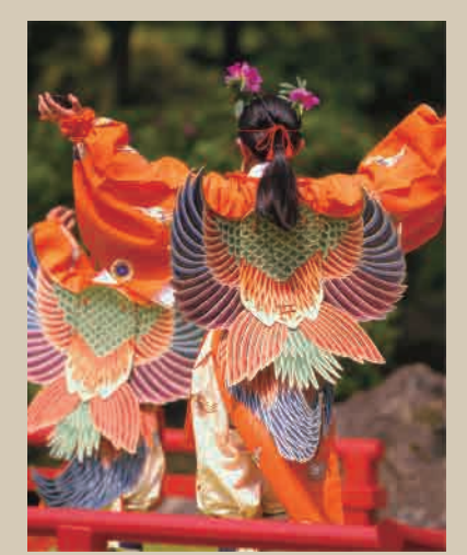
Bugaku, Kasugataisha Shrine (春日大社 舞楽)