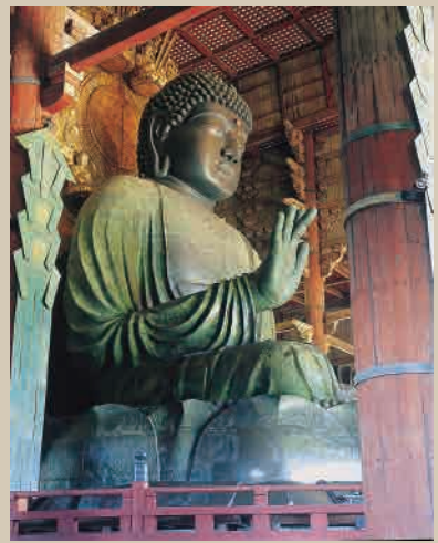
Great Buddha of Todaiji Temple (東大寺大仏)

The Chinese Association of Automation (CAA); China Instrument and Control Society (CIS); Asian Control Association (ACA)