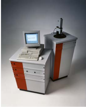
Fig. 4. The MPMS-XL, with the new Continuous Low Temperature Control and Reciprocating Sample Option, was first displayed at the APS meeting in March 1996.