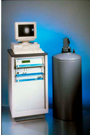
Fig. 3. An early PPMS system. This instrument is shown with the sample drive mechanism (on the top of the dewar and probe assembly) that provides the sample motion for the PPMS AC-DC Magnetization (ACMS) measurement option.

While developing the new PPMS system we also managed to fight off most of the competition for our MPMS. Hoxan had stopped offering their VTS clone, Metronique had failed, CCL had declared bankruptcy (to be reformed by its original owner under a new name), and we were rapidly winning the competition against Lakeshore. However, this situation wouldn't last for long and by 1995 the MPMS was once again facing competition – this time from Conductus.