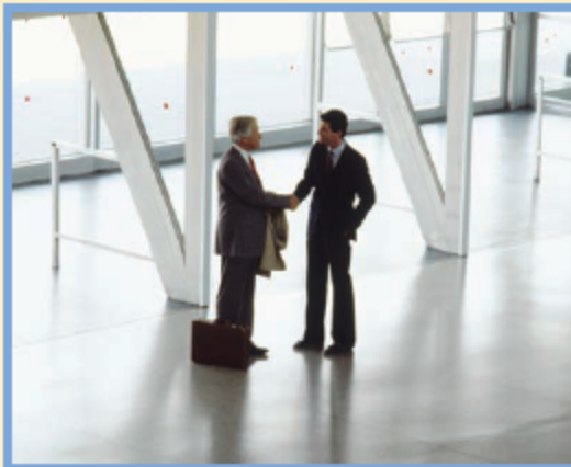
Exhibit Days and Hours

For more information please contact: Energy Conversion Congress and Exposition c/o Exhibits Manager 2025 M Street NW, Suite 800 Washington, DC 20036 P: 202.973.8744 F: 202.331.0111 ecce@courtesyassoc.com