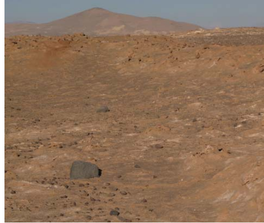
Figure 1. Typical terrain in the Atacama Desert of Chile presents many opportunities for scientific measurement and observation directly before the explorer, visible in the distance, and possible at long range.

Recent advances in robotic autonomy—particularly long autonomous traverse—will be transformative to these survey and monitoring