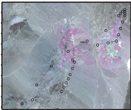
Figure 3. Rover autonomy can exploit orbital data to plan informative paths. The path, overlaid on orbital image, is the fixed-length circuit that best reconstructs of the remote image. Open circles represent planned acquisitions of reflectance spectra. This path provides "optimal ground truthing" and is recomputed on the fly as new spectra are collected

To this end, we have developed image analysis approaches that reliably detect targets such as rocks as well as more complex structures such as