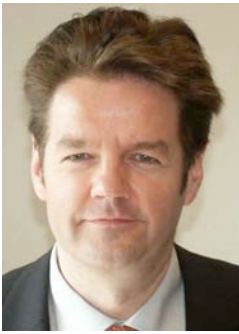
Ton van der Steen Ultrasonics