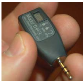
Figure 5. Probes for parameters that may be related to power quality are included: Temperature, Humidity, Barometric Pressure, etc. A GPS satellite receiver can ensure precise timing.

Perhaps more important, the communication cost of an installed power quality instrument, over the life of the instrument, often exceeds the cost of the instrument itself. Whether the communication is via Ethernet, or telephone modem, or short-distance radio, bringing the communication signal to the monitoring point is a significant cost.