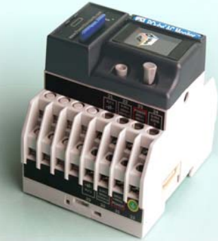
Figure 4. Prototype of the three-phase, voltage-and-current, 61000-4-30 Class A power quality monitor. The digital camera influence can be seen in the SD memory card, which holds up to 2 000 MB of data. Standard DIN-rail mounting means installation is cheap and quick.

Fully-automated manufacturing (robots for placing parts, automatic testing systems for verifying that boards are working properly, automatic calibration systems that adjust internal digital constants, etc.) means that manufacturing costs can be kept very low, even in locations with high labor costs like California, without any sacrifice in quality. Indeed, the quality is generally higher than products that are produced in regions with low labor costs, due to the highly-automated production and test procedures.