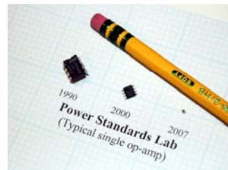
Figure 1: Reduction in component size. Smaller components reduce costs in several ways: smaller printed wiring boards, smaller plastic packages, even smaller power supply requirements. The packages shown are, from left, through-hole DIP, surface mount, and BGA or ball-grid-array.

Second, the development of relatively complex portable devices (PDA's, mobile phone that also have computer functions, digital cameras, etc.) means that extremely tiny, high-reliability electronic devices are now readily available: connectors with large numbers of pins, tiny op amps, and passive components like resistors and capacitors. Tiny means cheap, in general, if the manufacturing is completely automatic.