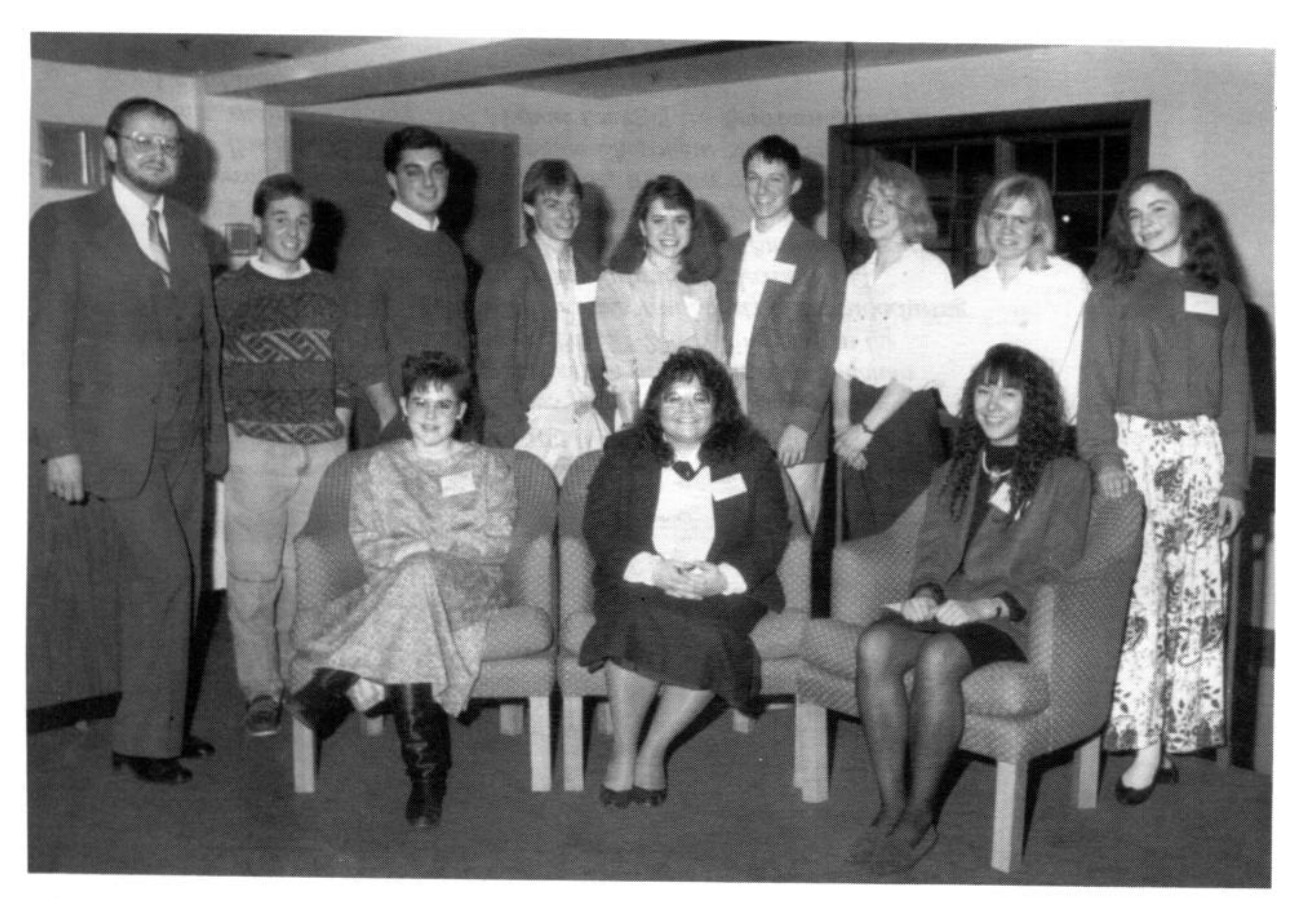
Paper Writting Contest winners February 1990