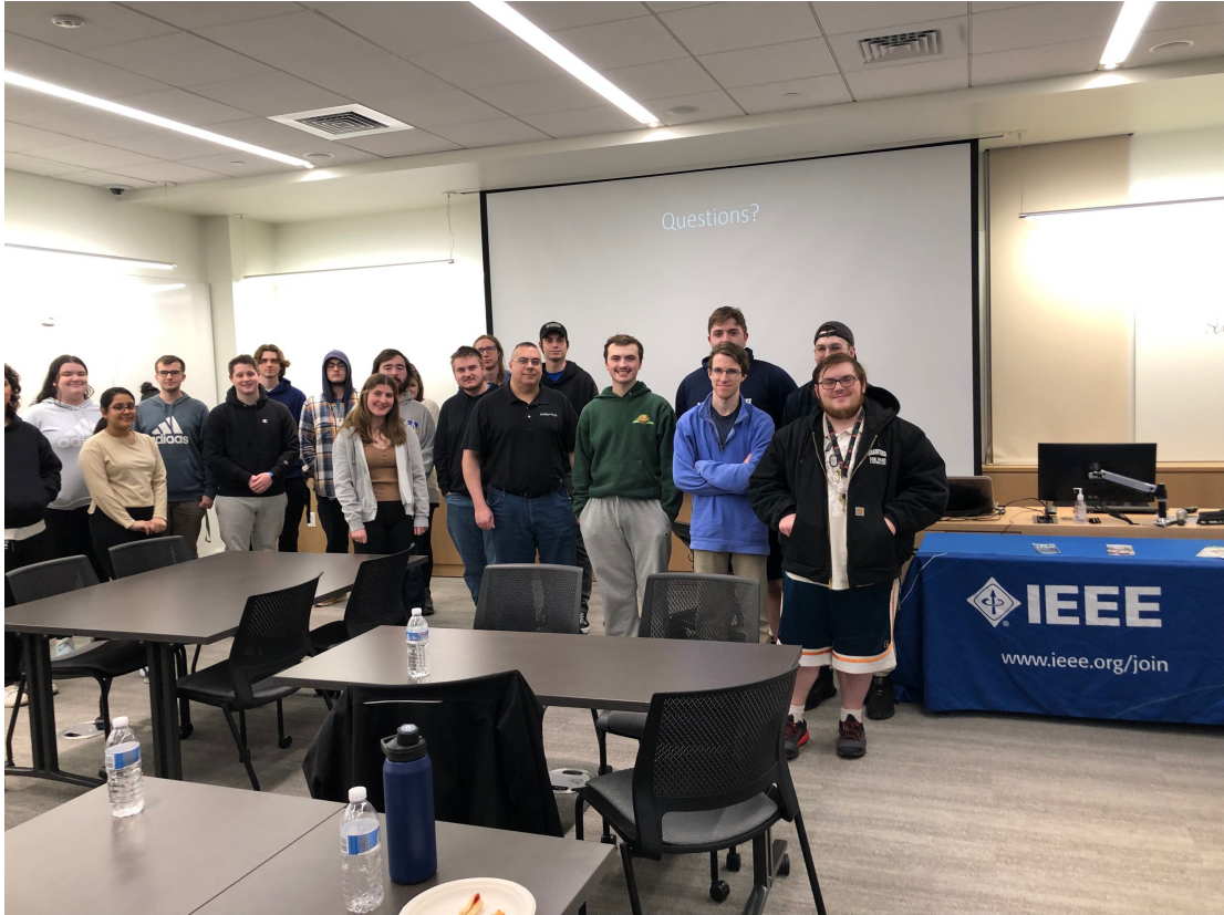
Students with the speaker after the talk. One of the bet parts of live seminars.