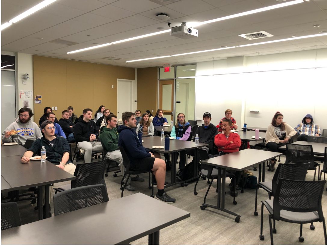
Students and professionals