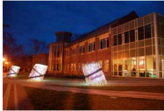
View of the library from the front on Washington Street, day and evening.