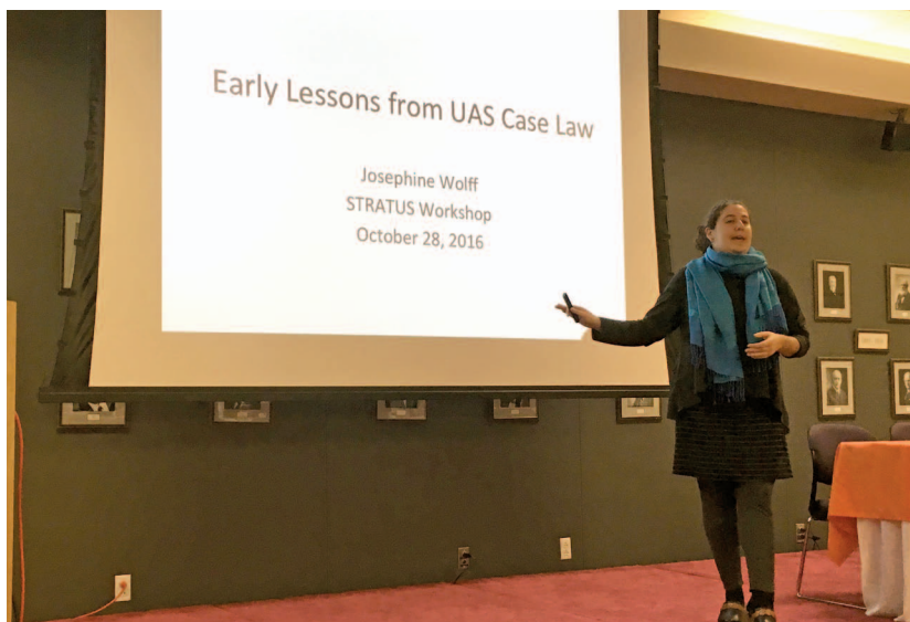
FIGURE 3. Prof. Josephine Wolff, RIT, giving a presentation at the STRATUS 2016 Workshop.

This first workshop had a two-track submission process. Individuals could either submit an abstract (plus presentation) or a four-page, full peer-reviewed paper (plus presentation); these papers appear on IEEE Xplore . We solicited work