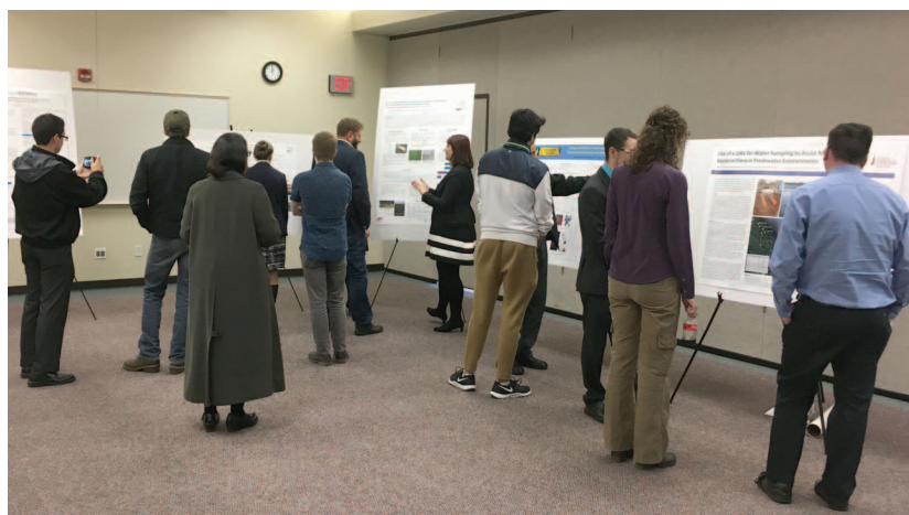
FIGURE 5. A poster session at the STRATUS 2016 Workshop.