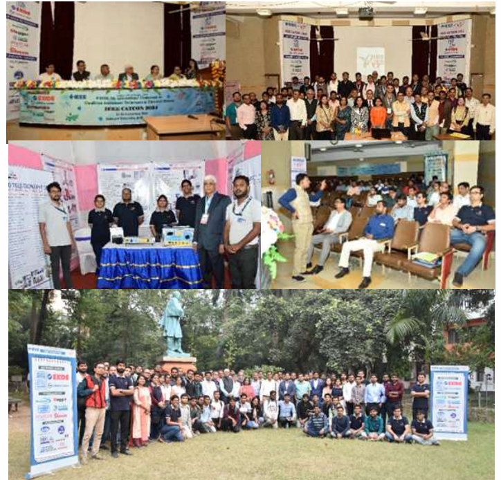
Glimpses of IEEE CATCON 2024

Physical Acoustics India Pvt. Ltd., and Rectifiers& Electronics Pvt. Ltd., joining as sponsors and partners. Their active involvement bridged academia and industry, enriching discussions with practical insights.