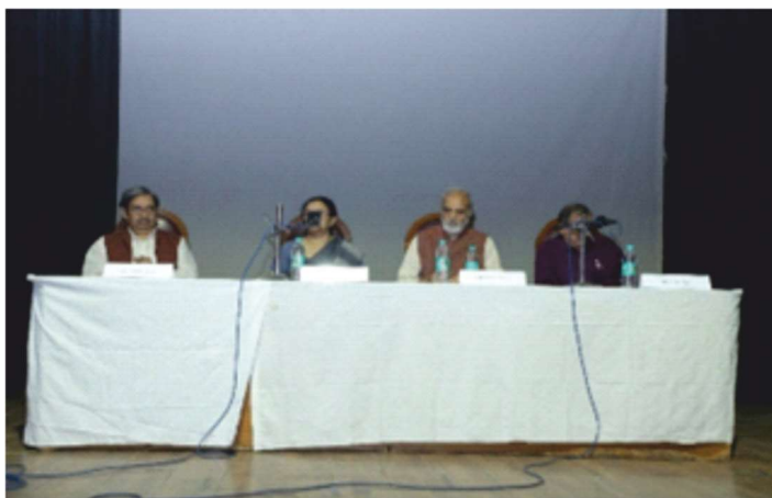
Glimpse of the Sir C.V. Raman Milestone Commemorative Lecture