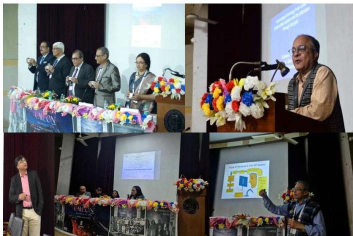
Glimpses of CALCON 2024