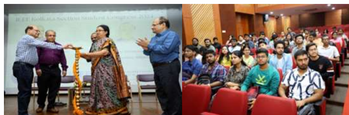
(L) Inaugural Session of the Student Congress (R) Student Delegates at the Congress

The IEEE Student Congress 2024 provided an enriching experience for students, bridging the gap between academia and industry, and motivating them to take proactive steps in their professional journey.