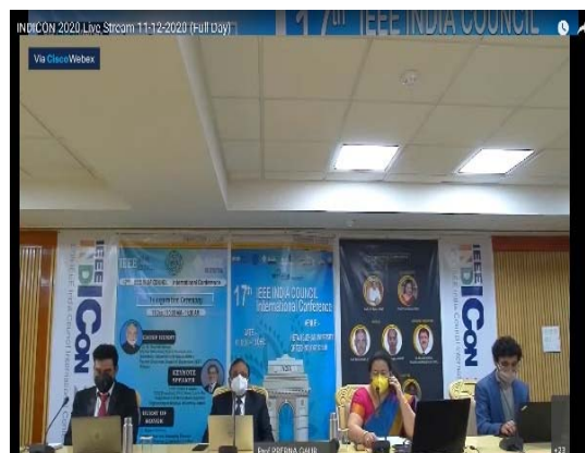
Simu-live inauguration of INDICON2020