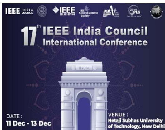
INDICON2020 – 17 th Edition in New Delhi