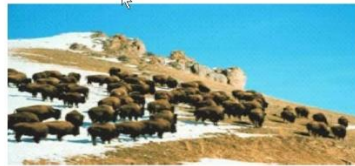
Bison Herd Model

Early settlers immobilized bison herds by seeking out and killing the alpha male! Organizations led by leadership base on permanent precedence are vulnerable