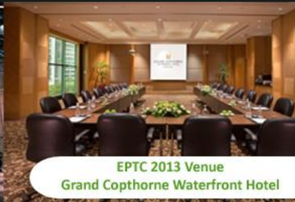
EPTC 2013 Venue Grand Copthorne Waterfront Hotel