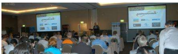
Down to Earth 2012 Conference

The "Down to Earth Conference 2012" (DTEC12) was held at the Crowne Plaza Hotel in the Hunter Valley on October 9-11. The conference was run by Engineers Australia and the NSW Section of IEEE, through the NSW PES Chapter was a technical sponsor of the event.