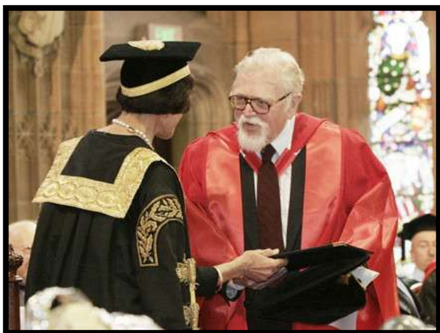
Receiving the DSc(Arch) in 2008