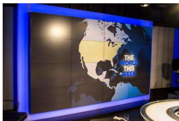
ABC 7:30 Studios

I attended the ABC site tour on Friday 10 August. There were almost 30 visitors that attended the tour hosted by ABC stuff. The tour included the Control Room, the 7:30 Report and Media Watch Studios, Studio 22, makeup and prop rooms as well as back stage areas. We also viewed the Regional Radio studios during actual broadcasting. Studio 24 unfortunately was not accessible due to refurbishment work.